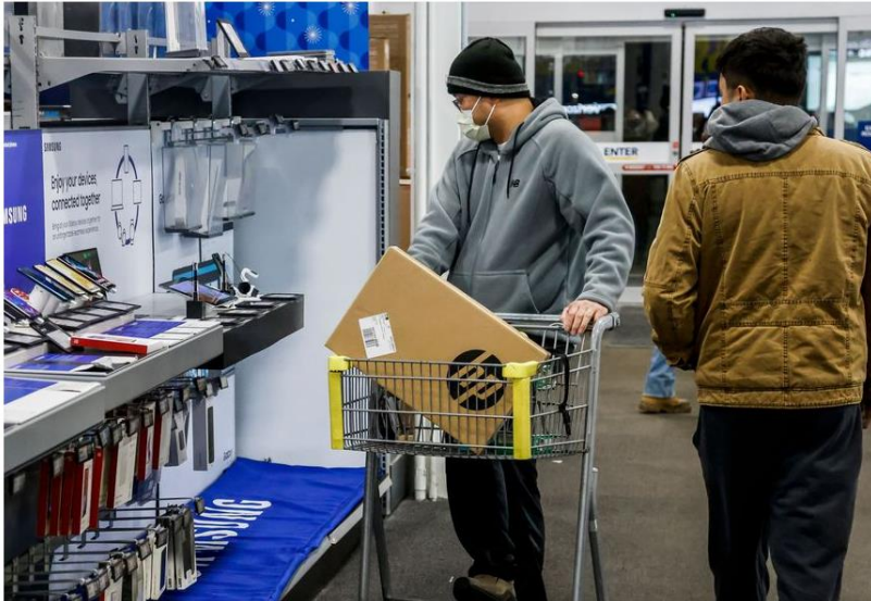
HP and Dell, two of the largest PC makers, had their products fly off of the shelves earlier in the pandemic.

Semiconductor companies slash production plans amid weak demand