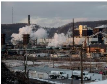
U.S. Steel's Clairton coke plant has come under scrutiny after a 24 fire triggered an air quality alert from the release of sulfur dioxide.